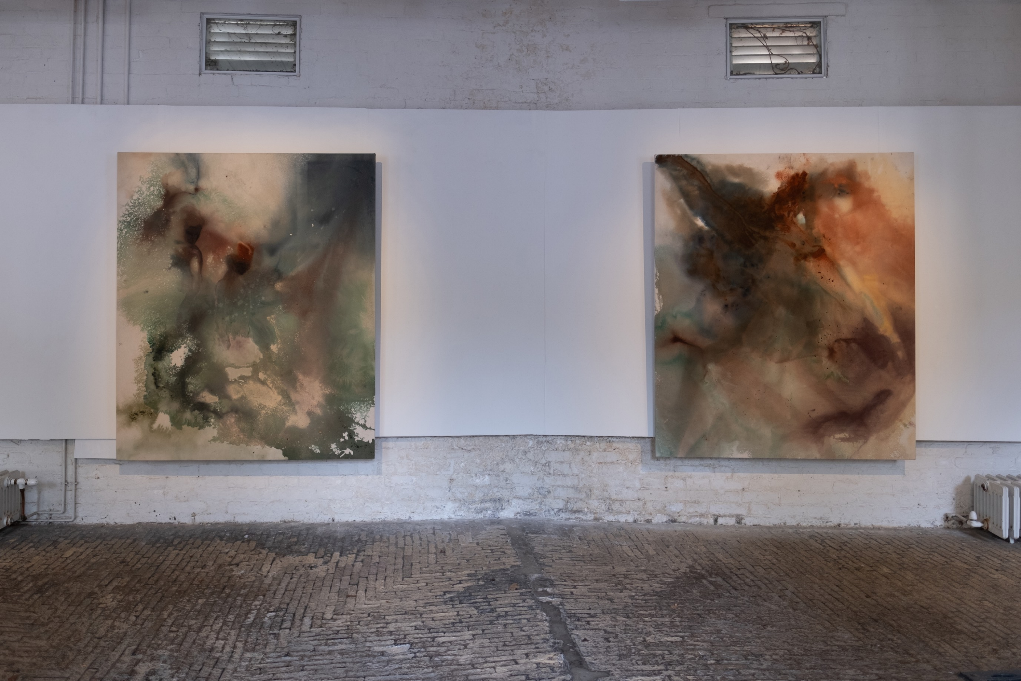
From exhibition RESIDUE Orleans House Gallery, London 2022