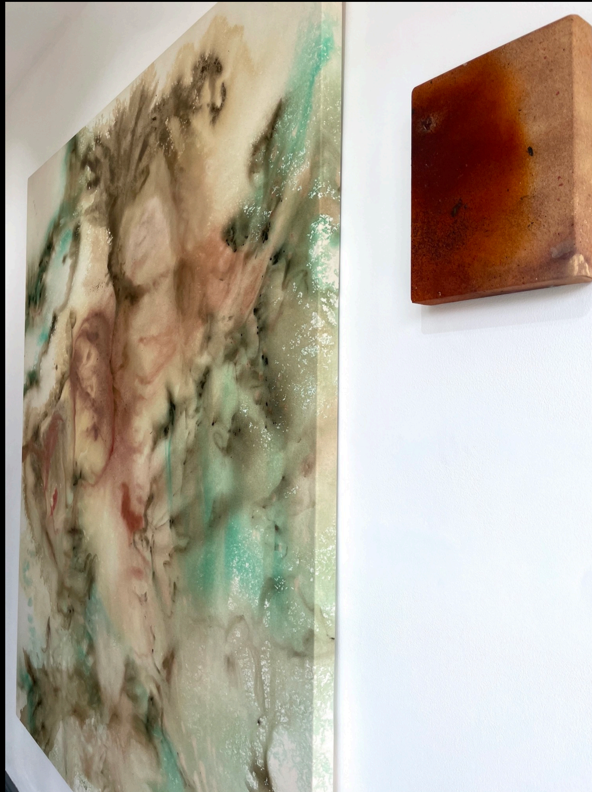
From exhibition THE PULL OF THE TIDES Liminal Gallery, Margate 2023