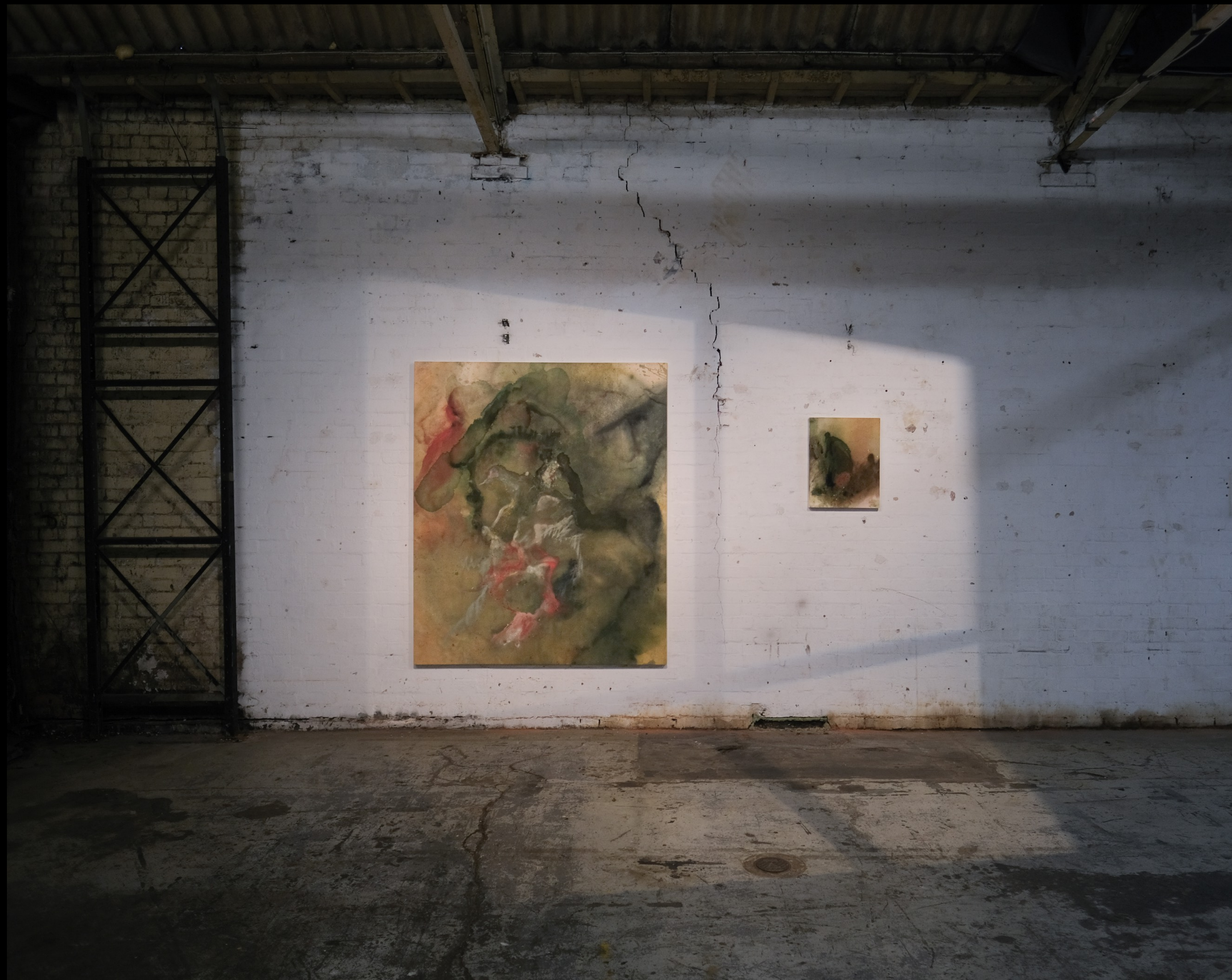
From exhibition BRINK Tiderip/Ugly Duck, London 2023