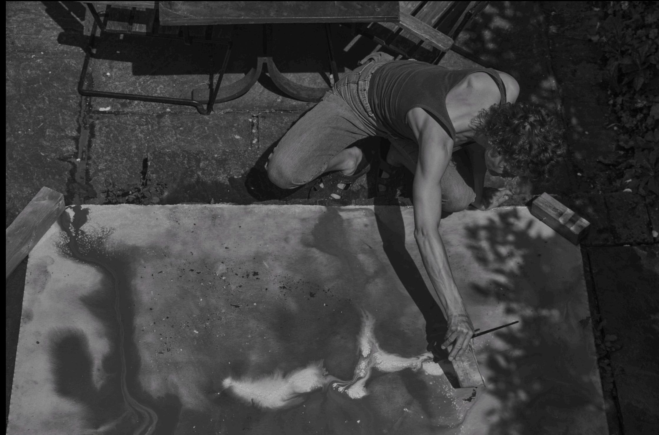
Above image from south London studio. Click here for my summer studio in Sweden.